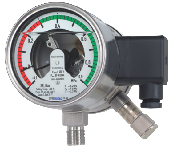
Gas Density Monitor (GDM) with Integrated Gas Density Transmitter, Model 233.52.100 TI

The gas density transmitter picks up the pressure and temperature of the SF 6 -gas contained in the device (tank). The current gas density is ascertained from both variables by means of an electronic evaluation system. Thermal